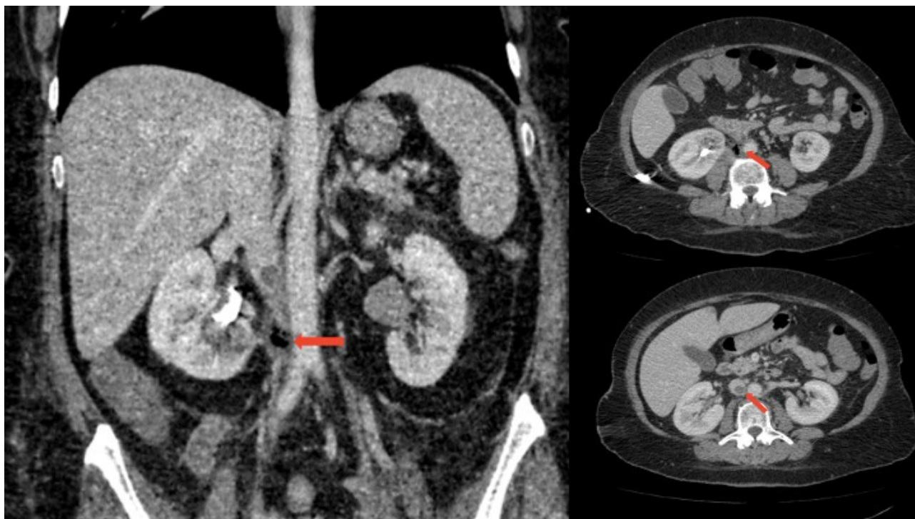
Figure 1 CECT of the abdomen show a fistula between horizontal part of duodenum and IVC. Thrombosis of the inferior vena cava (IVC) and a gas bubble in its lumen can also be observed.